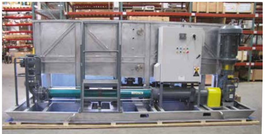
Design of the basic unit with customized controls for a mine in the midwest USA

The base unit includes a tank, progressing cavity pump with right angle gearmotor, inspection ladder, valves, and piping all mounted on a common galvanized steel skid. NETZSCH can optionally provide a unit with a control panel (with or without VFD on a removable stand) and instrumentation such as high/low level switches for the tank or dry run protection for the pump.