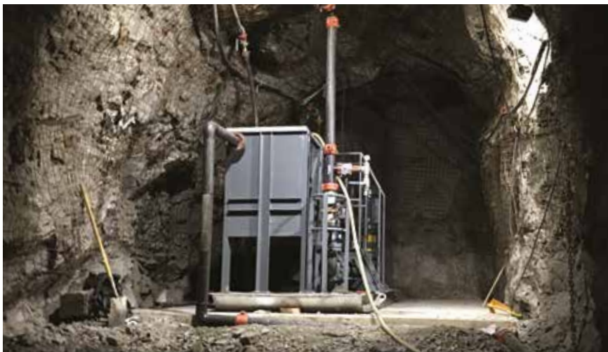
NETZSCH Mine Dewatering Unit for a gold mine in Montana, USA

Individual pumps are available to retrofit your existing skid.