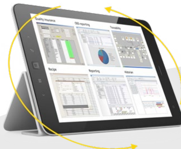
GEA MES applications

OptiPartner is one of our optimization solutions for spray dryers. You know that even the smallest deviation in quality and consistency during the drying process can lead to downstream problems, to rejected product or loss of production time. We have developed OptiPartner to help minimize these deviations, to give you precise control of residual moisture in the final powder and to optimize drying conditions in the spray dryer.