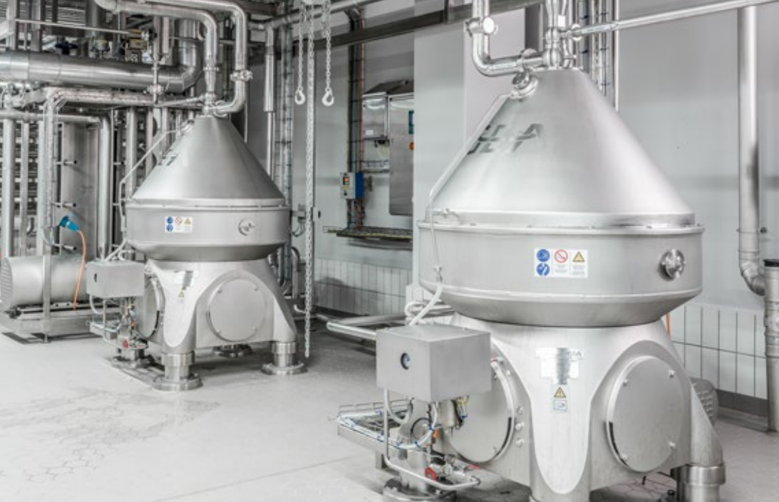
MSI skimming separator