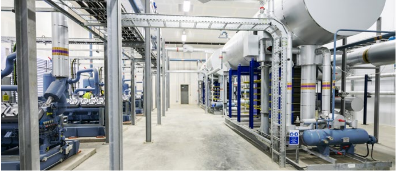
Industrial refrigeration solutions