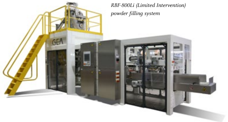
RBF-800Li (Limited Intervention) powder filling system

For packing in bulk 25 kg (55 lb) bags our range of multi-wall bag/sack fillers is designed to pack powdered products at rates of 4.5t/h to 12t/h or more, with an accuracy of 10g (0.35oz) or better.