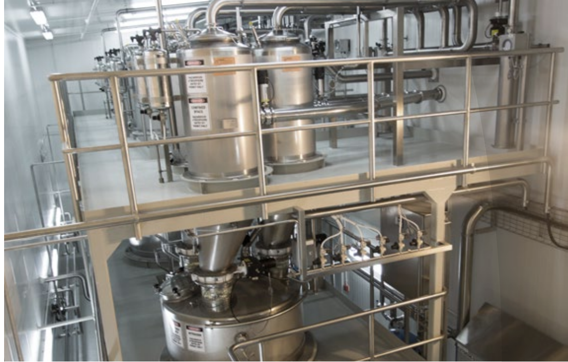
Pre-gassing system for modified atmosphere powder packing lines (MAP)