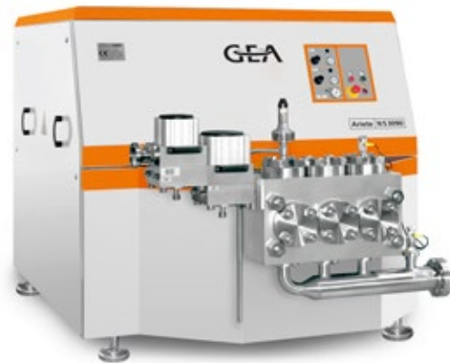
High pressure homogenizer

This configuration aids agglomeration, which is a key property that determines wettability and solubility of the final powder. Our systems can also be configured for producing non-agglomerated powders.