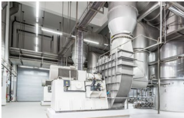
Evaporator with MVR fan

Spray drying is a critical stage in producing a consistent and stable powder structure and ideal density. All spray drying technology from GEA is designed to give you the assurance of optimum powder quality, consistency and stability, every batch.