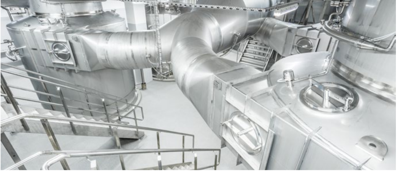
Dryer exhaust system