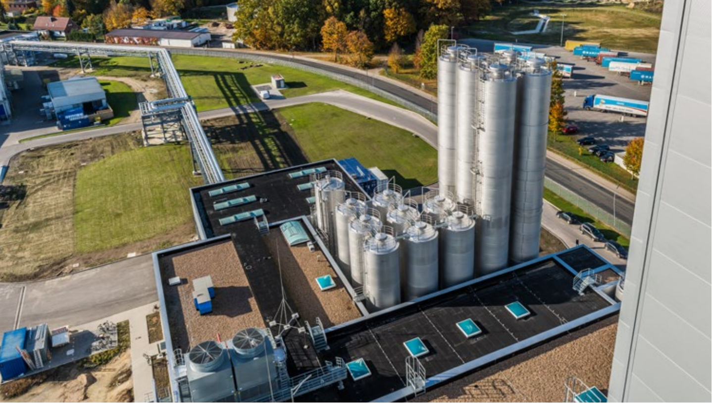
Milk powder factory