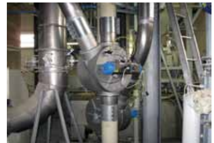
Drum-type diverter valve in pneumatic conveying system