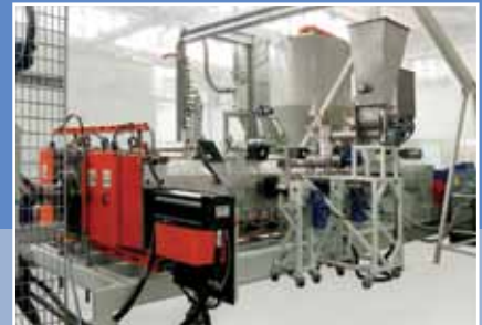
Micro-batch feeders on top of extruder