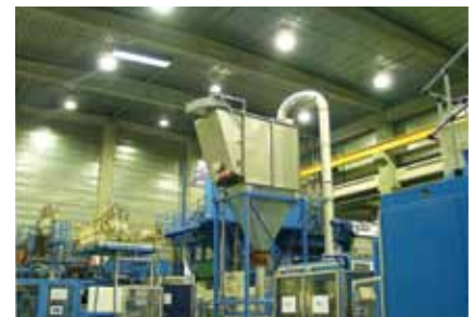
Dust collector in car tank factory