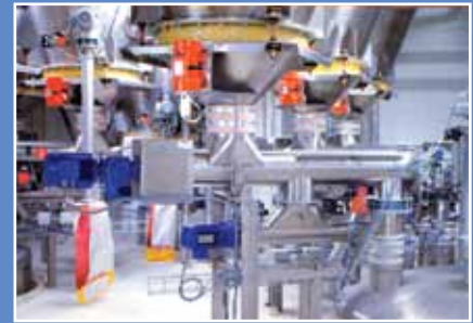
Bin activators and precision screw feeders

03/2021/50 September 2012 Rights reserved to modify technical specifications.